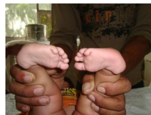
Photographs at presentation