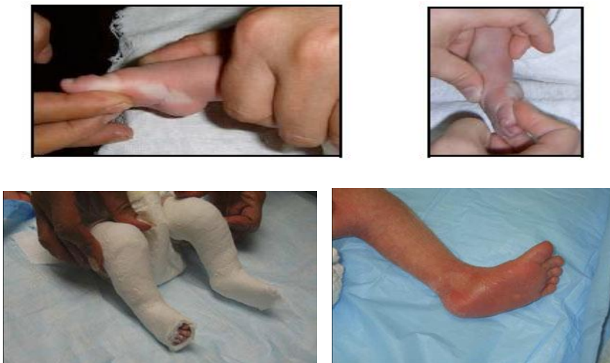
Figure 1: The First cast: Correction of cavus deformity

In doing so, the cavus (Figure 1) is corrected, typically after one cast.