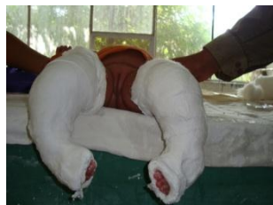
After 1 st cast