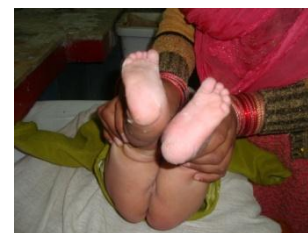
Figure 4. Serial photographs of a two Months old female child with Bilateral Clubfeet

In the study while evaluating the pre and post Pirani scores (Table 2) and the goniometric measurements by the Wilcoxon Signed Rank