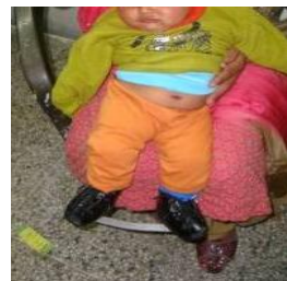
With abduction brace