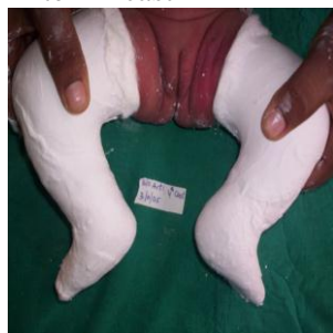
4 th (final) cast