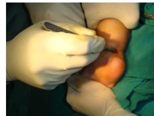
Tenotomy after 3 rd cast