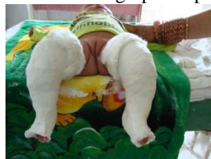
After 2 nd cast