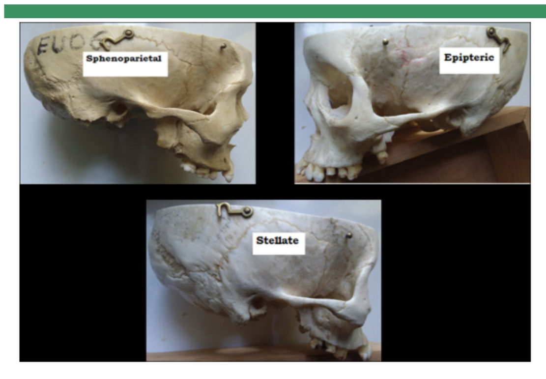
Figure 2: Identified types of the pteria on skulls of unknown sex age and nationality obtained from the anatomical museum in the Department of Human Anatomy, School of Medicine, College of Medicine and Health Sciences, University of Gondar, Ethiopia, 2020.