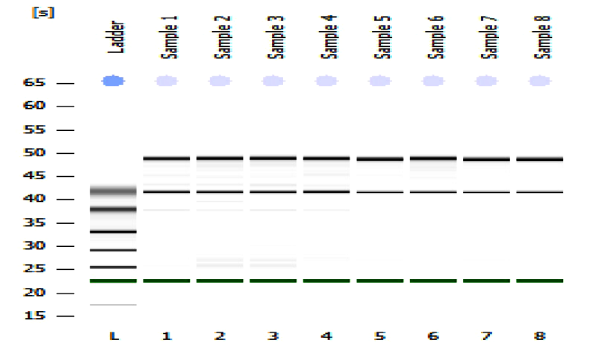
Fig.1: The results of RNA analysis by Agilent bioanalyzer (A) Lane 1 of A shows the molecular marker while lanes 2-9 contain RNA from HEK293 cells.

RNA was DNAse treated using the Ambion TURBO DNA-free<sup>TM</sup> Kit (Life Technologies). The concentration and purity of the RNA was measured on a Nanodrop spectrophotometer (Thermo Scientific, Wilmington, DE) and also analysed on an Agilent 2100 Bioanalyzer (Agilent Technologies) to check the RNA integrity (Fig 1).