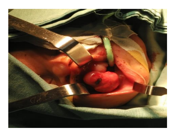
Figure 1 : Pre-op view of 5<sup>th</sup> day neonate's congenital granular cell tumor

On examination, there was a solitary, firm, pedunculated mass, measuring about 3.5cms in diameter. It was arising from the upper alveolar ridge over the right lateral and central incisor area (Figure 1). There was no difficulty in respiration, but the mass interfered while breast feeding. Therefore, a nasogastric tube was passed due to concerns over feeding.