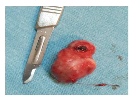
Figure 2: Excised congenital granular cell tumor

She was scheduled for surgery on the 5<sup>th</sup> day after birth. The excision of this mass was done under general anaesthesia with oral endotracheal intubation. Monopolar electrocautery was used, and there was very minimal blood loss (Figure 2). In postexcision, any kind of alveolar defect was not noted (Figure 3). Postoperative recovery was uneventful. Nasogastric tube feeding was intiated 3 hours after surgery. The child was breastfeeding 48 hours after surgery, and she was discharged the following day. Healing was uneventful, and the gingival reepithelised in 10days. Histopathology revealed focal ulceration with underlying stroma demonstrating large sheets of closely packed, polygonal cells with round, regular nuclei and inconspicuous nucleoli. It also showed abundant granular cytoplasm consistent with the diagnosis of congenital epulis, or congenital granular cell tumor (Figure 4).